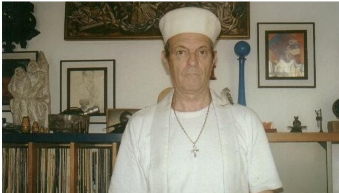
The Rosicrucian Artist at his atelier in Niteroi city, Rio de Janeiro State, Brazil, SA