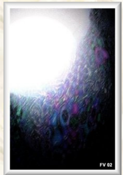
"Light and Darkness"