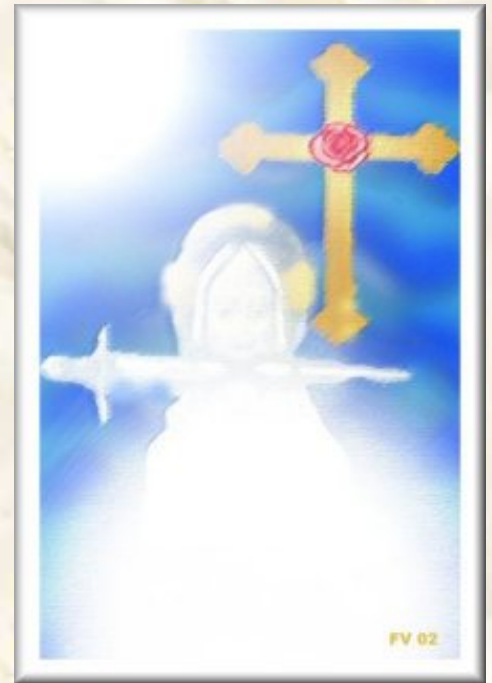
"The Hidden Rose+Christ"