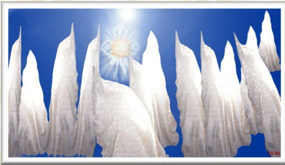
"The 13 Elders Founders of the Rosicrucian Order"