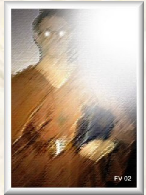
"Before the Great Initiatic Light"